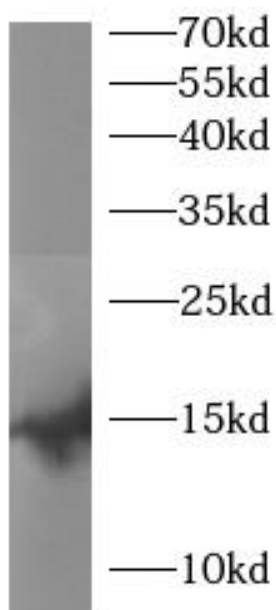
mouse brain tissue were subjected to SDS PAGE followed by western blot with CAF50480(SYUB antibody) at dilution of 1:1000